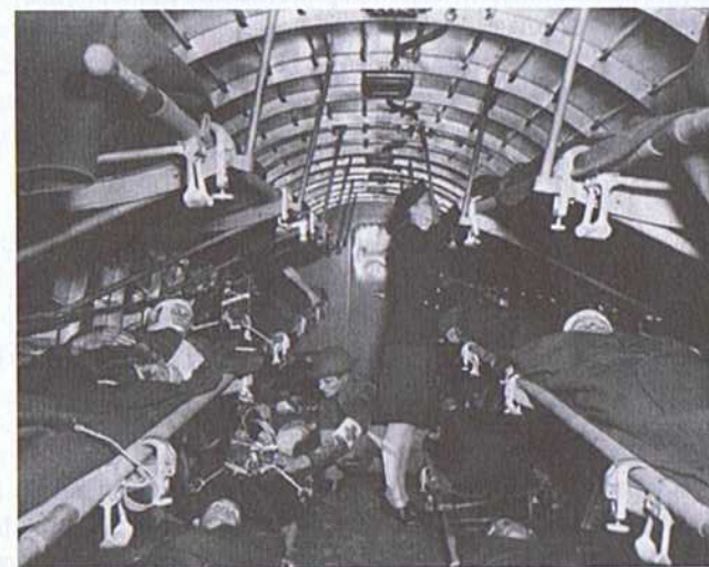
Flight nurse prepares for takeoff, North Africa, December 1942.