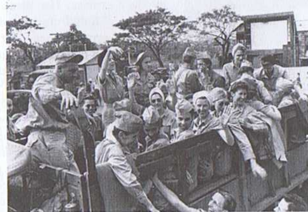
These Army Air Forces nurses, imprisoned on Bataan and Corregidor, Philippine Islands, were freed after three years of imprisonment. Manila, Luzon, Philippine Islands, February 1945.

June 9: Flight nurses of the 816th Medical Air Evacuation Squadron (MAES) flew "blood runs" to Normandy, airdropping fresh blood.